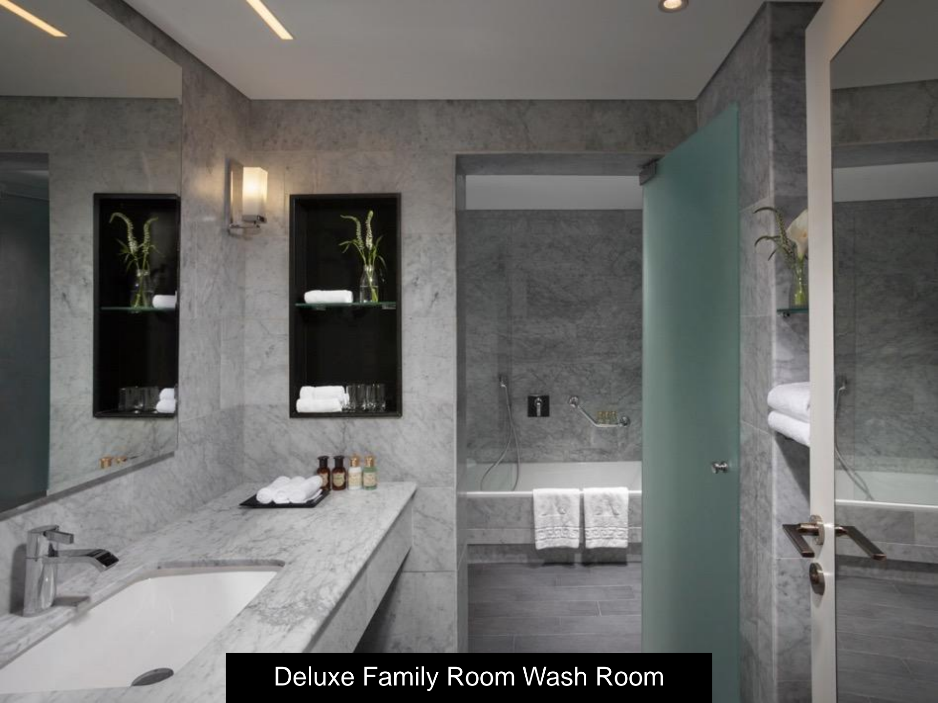
Deluxe Family Room Wash Room