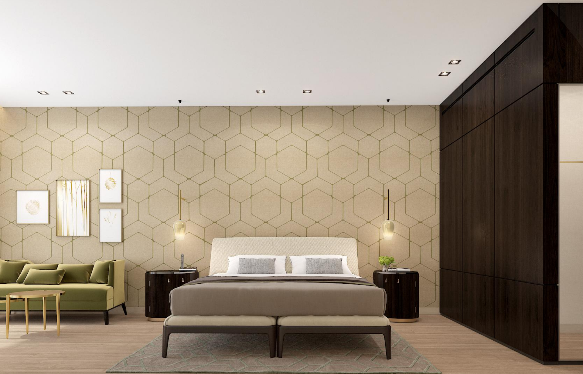
New- Premium old city room