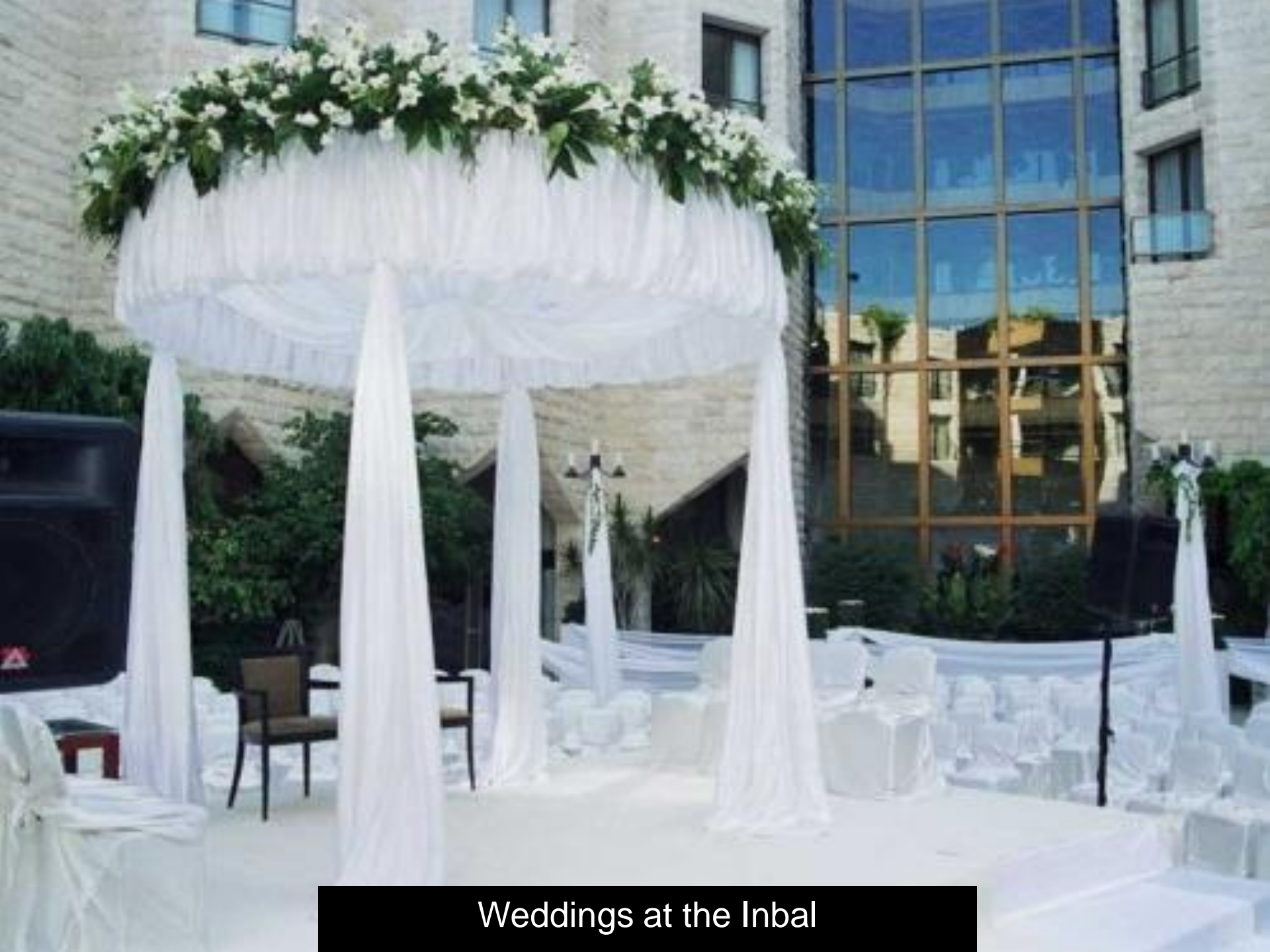
Weddings at the Inbal