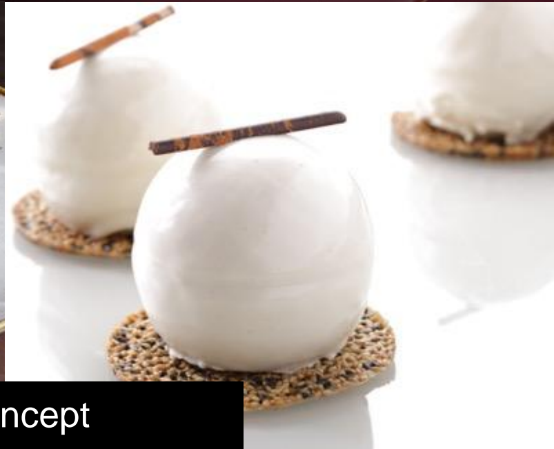
Restaurant new concept