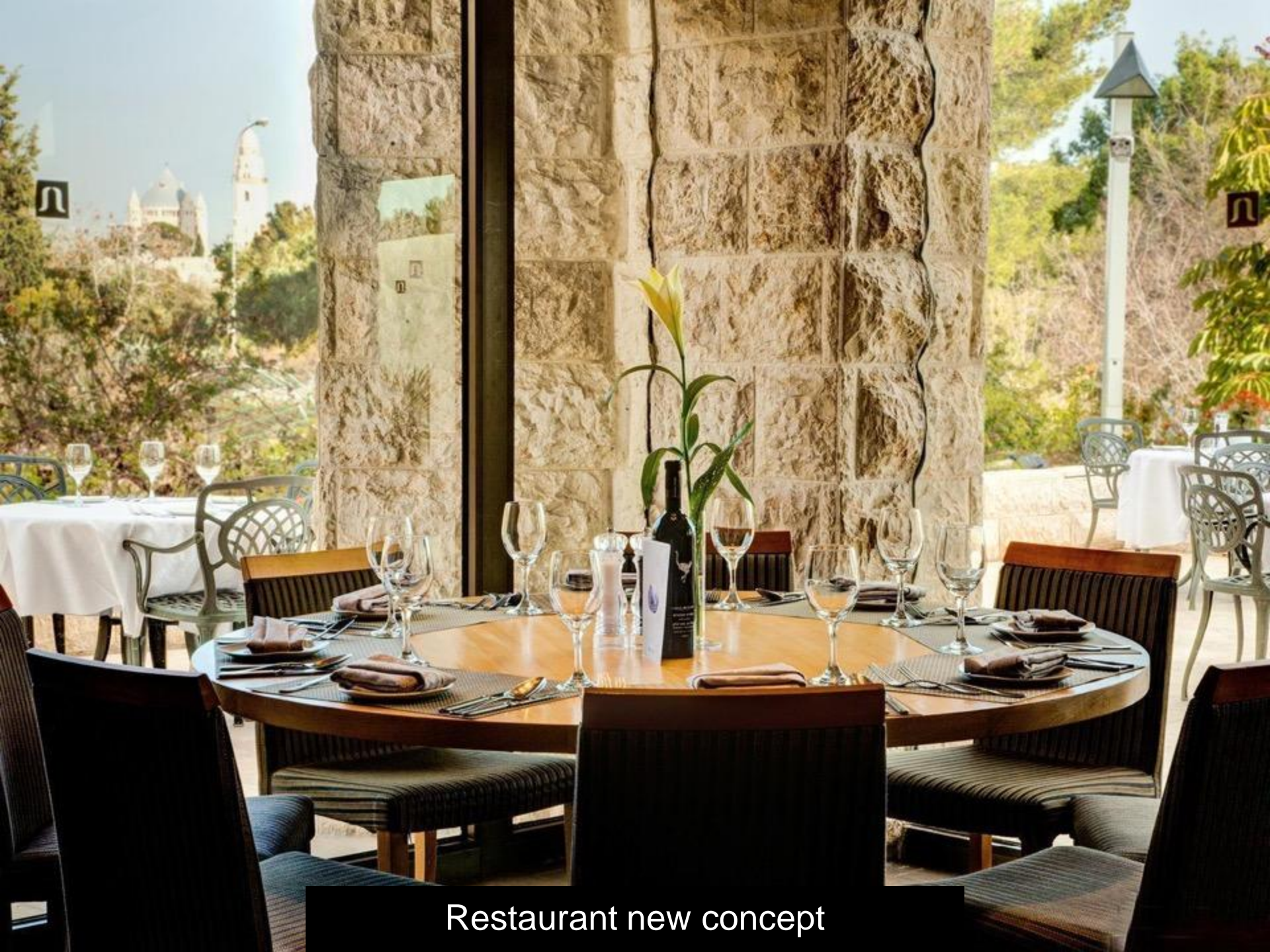
Restaurant new concept