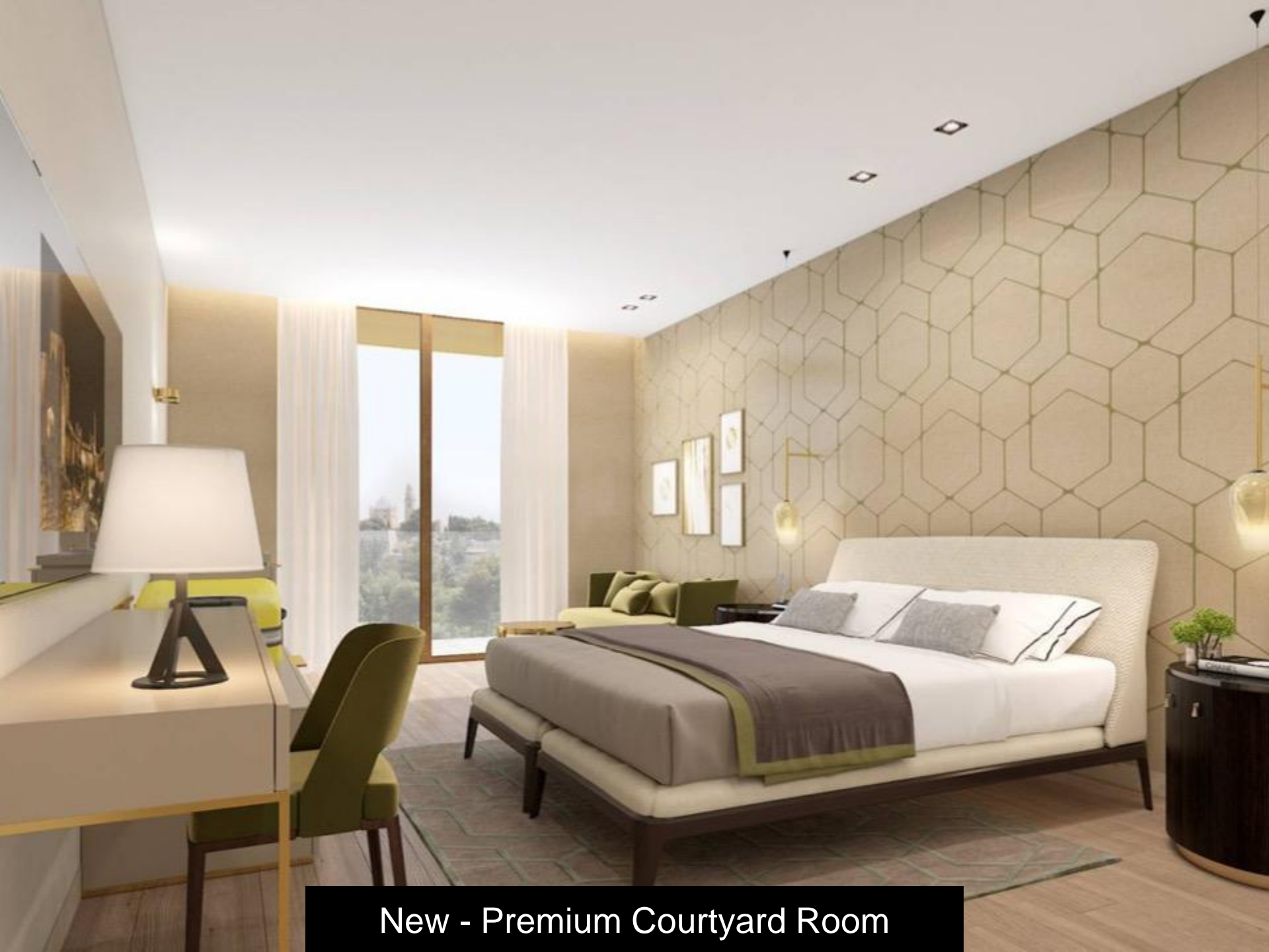
New - Premium Courtyard Room