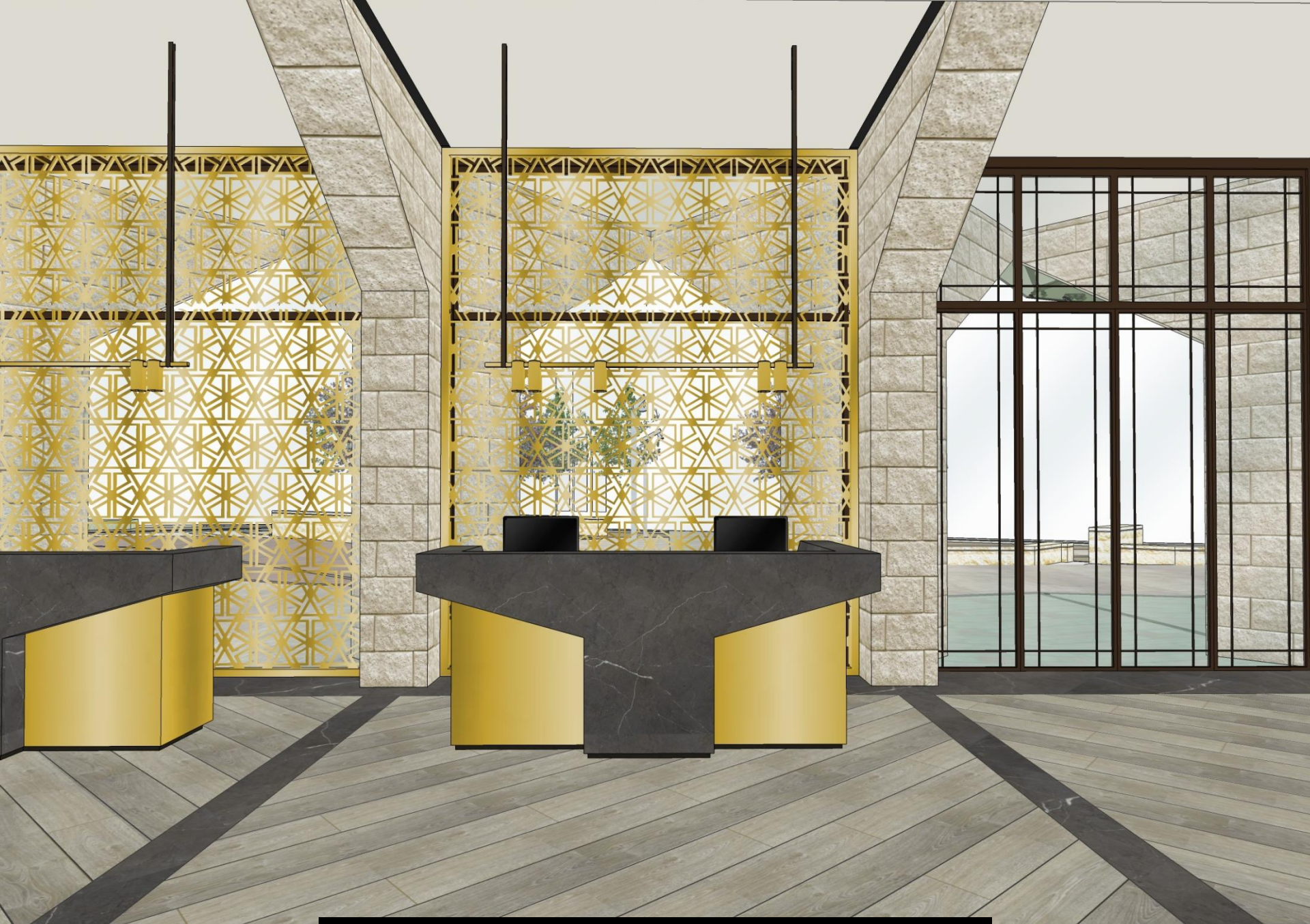
The New Lobby