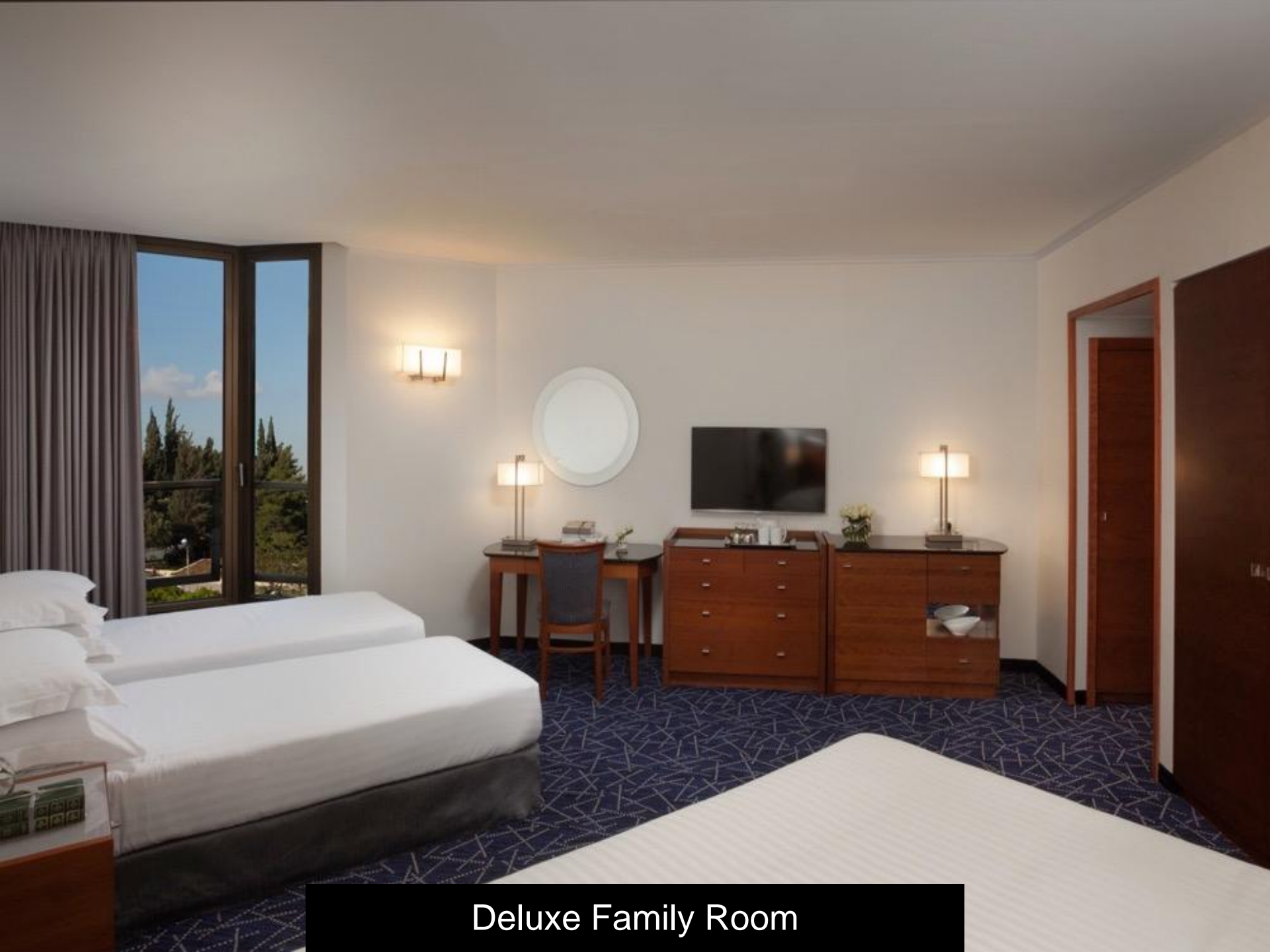
Deluxe Family Room