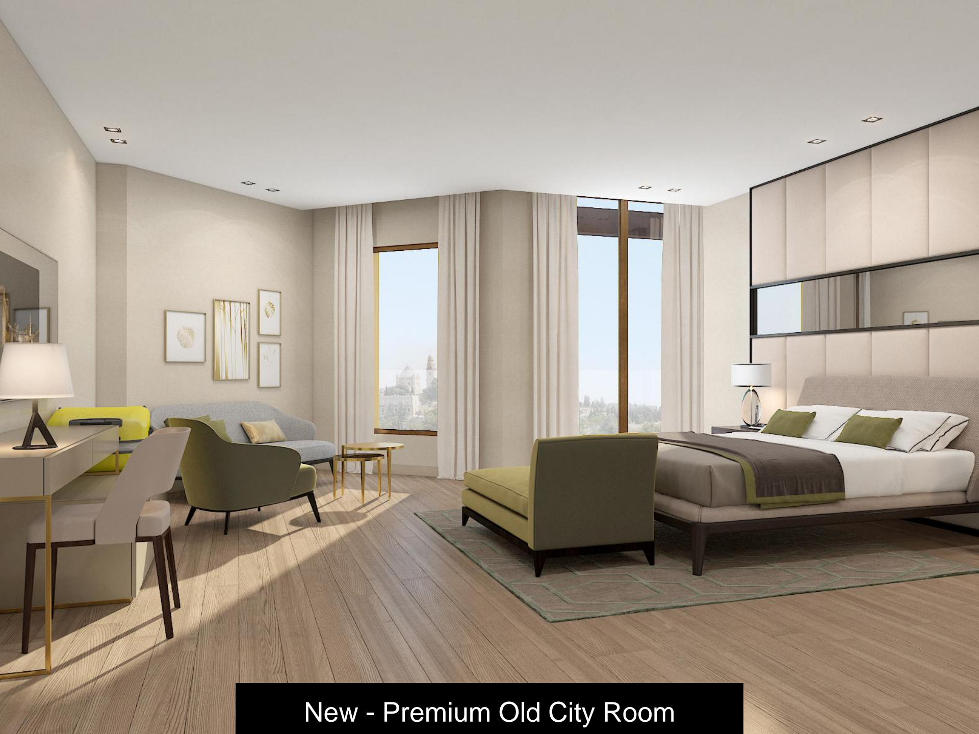
New - Premium Old City Room