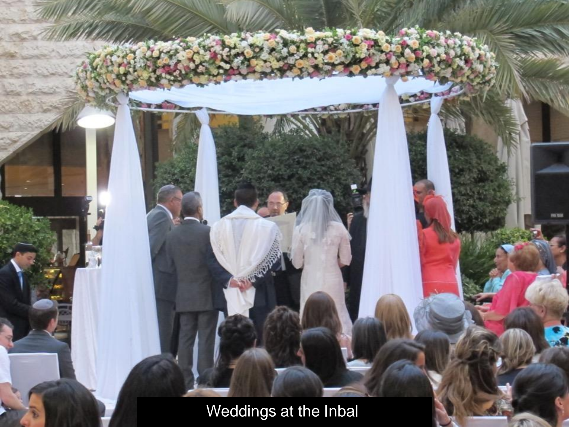
Weddings at the Inbal